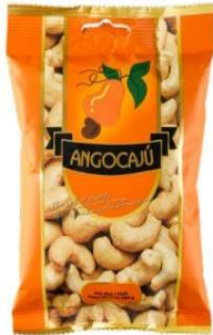
Cashew nuts with piri-piri - 200g

Ingredients: Cashew nuts, vegetable oil.