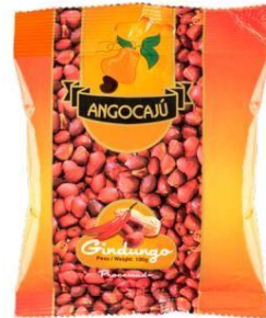
Peanut with Piri-piri - 100g

Ingredients: Peanut, vegetable oil and salt.