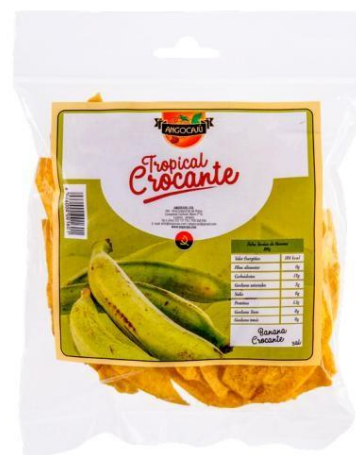
Crispy banana 70g

Ingredients: Cassava, vegetable oil and salt.