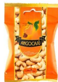
Cashew nuts with salt - 30g

Ingredients: Cashew nuts, vegetable oil and salt.