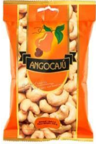
Natural Cashew Nuts - 200g

Units per box: small boxes: 24 packages, large boxes: 66 packages.