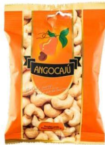
Cashew nuts with piri-piri -100g

Ingredients: Cashew nuts, vegetable oil, chilli.