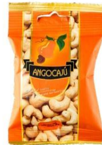
Cashew nuts with piri-piri - 30g

Ingredients: Cashew nuts, vegetable oil, chilli.