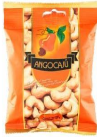
Natural Cashew Nuts - 100g

Ingredients: Cashew nuts, vegetable oil.