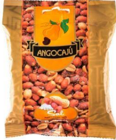
Peanut with salt - 100g

Units per box: small boxes: 32 packages (100g) large boxes: 112 packages (100g).