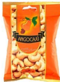
Cashew nuts with salt - 100g

Ingredients: Cashew nuts, vegetable oil and salt.