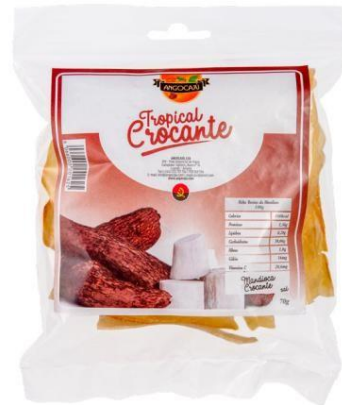
Crispy cassava 70g

Units per box: small boxes: 24 packages (70g) large boxes: 42 packages (70g).