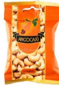
Natural Cashew Nuts - 30g

Ingredients: Cashew nuts, vegetable oil.