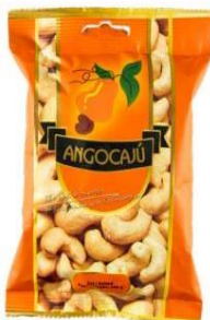
Cashew nuts with salt - 200g

Ingredients: Cashew nuts, vegetable oil, chilli.